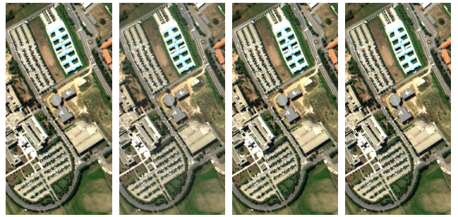
Fig. 2. HS+MS fusion results. 1st: FUSE using Gaussian prior, 2nd: R-FUSE using Gaussian, 3rd: FUSE using TV and 4th: R-FUSE using TV.

In this section, we consider a kernel similar to the one used in Section IV-B, which is displayed in the middle of Fig. 3 (the difference between the two kernels is shown in the right). Note that this trivial change makes the FT of the new kernel have