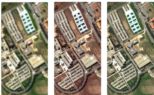
Fig. 1. Pavia dataset: HS image (left), MS image (middle) and reference image (right).

We consider the Bayesian fusion with Gaussian [10] and total variation (TV) [12] priors that were considered in [1]. The subspace matrix \mathbf{H} was estimated using PCA as in [1]. The proposed R-FUSE and FUSE algorithms are compared in terms of their performance and computational time for the same optimization problem (corresponding to (18) in [1]). The estimated images obtained with the different algorithms are depicted in Fig. 2 and are visually very similar. The corresponding quantitative results are reported in Table I and confirm the same performance of FUSE and R-FUSE in terms of the various fusion quality measures (see [10] for the definitions of RSNR, UIQI, SAM, ERGAS and DD). Note that the results associated with a TV prior are slightly better than the ones obtained with a Gaussian prior, which can be attributed to the well-known denoising property of the TV prior. A particularity of the R-FUSE algorithm is its reduced computational complexity due to the avoidance of any permutation in the frequency domain when solving the Sylvester matrix equation, as demonstrated by the computational time also reported in Table I. More simulation results on different datasets can be found in the technical report [25].